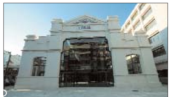
THE MODERN auditorium can seat 232 people

will house the music conservatory. The foundation and structure are made of concrete and steel and 3,181 m 2 of marble and 477 m 2 of floating beechwood flooring, in the audition hall and runway, were used in the building's interior. FCC was also in charge of the foundations, distribution of interior space, finishes, air-conditioning, sanitation, electric installations, and the information and audiovisual systems. ■