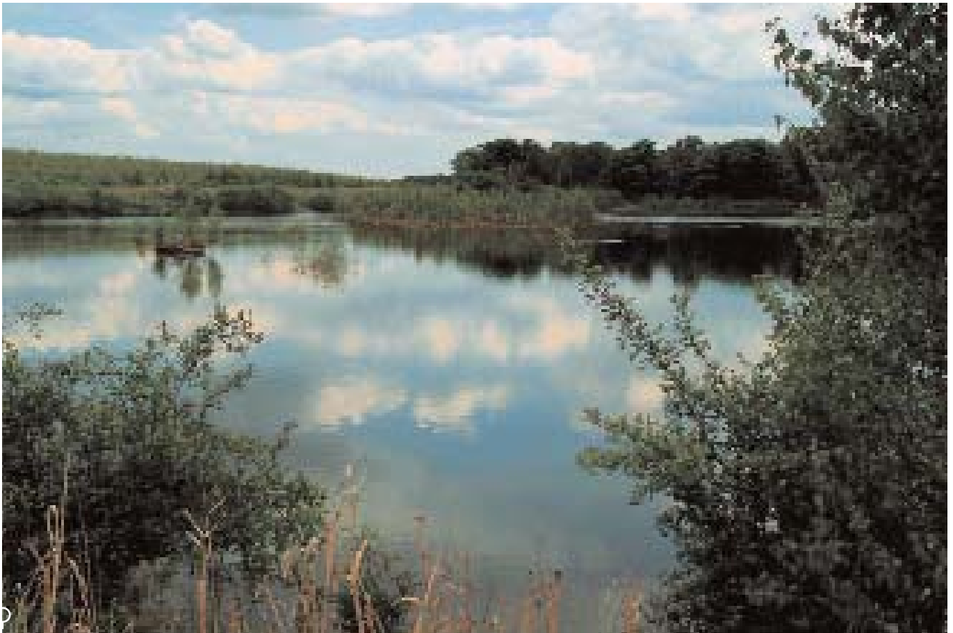
ABOVE, THE MOORE NATURE RESERVE, MANAGED BY WRG, WHICH IS PART OF THE RESTORATION WORK CARRIED OUT AT THE ARPLEY LANDFILL SITE. THE RESERVE HAS 80 HECTARES OF FORESTS, MEADOWS, LAKES, AND PONDS. IT IS CONSIDERED ONE OF THE MOST IMPORTANT CONSERVATION SITES IN NORTHEASTERN ENGLAND. OPPOSITE PAGE, AN AERIAL PHOTO OF THE ARPLEY LANDFILL SITE.