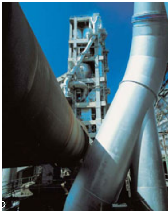
THIS PRACTICE IS DEVELOPED IN THE CEMENTOS PORTLAND VALDERRIVAS factory at Lemona, where, in addition to used tyres, the company uses recycled plastics, wood, or animal meal.

This new method will be developed at the Lemona cement plant, which in addition to used