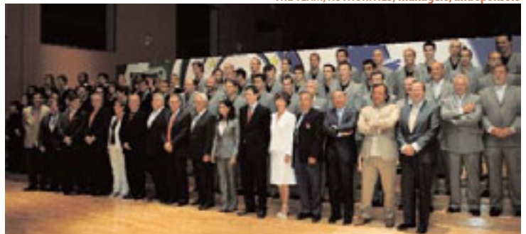
THE TEAM, AUTHORITIES, managers, and sponsors

sponsor for the last nine years, extending its sponsorship last year for another three years. Esther Koplowitz, FCC's major shareholder and vice-chairman of the Cementos Portland Valderrivas Board of Directors, is the team's "Sponsor of Honour". ■