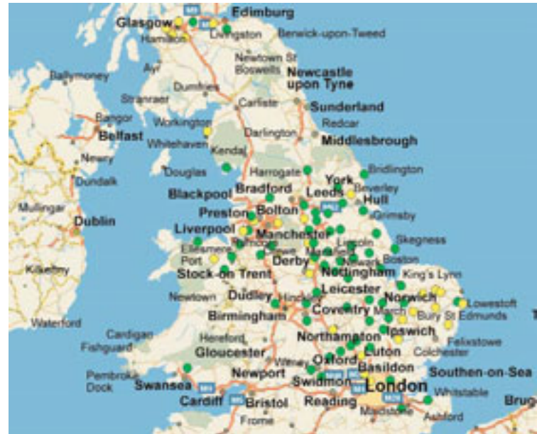
● Dumping sites. ● Transfer stations.

The European Commission gave FCC its approval for acquiring the British company Waste Recycling Group (WRG) after confirming that the operation would not adversely affect the competition.